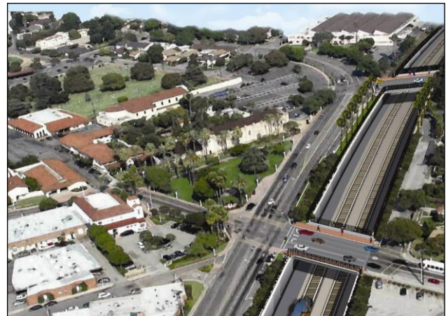
Aerial rendering of the completed trench