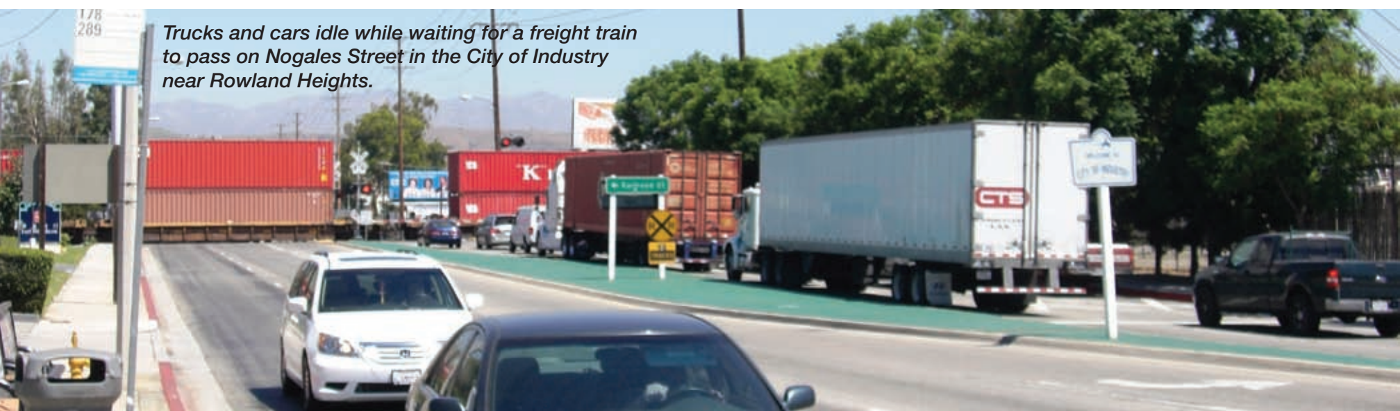
Trucks and cars idle while waiting for a freight train to pass on Nogales Street in the City of Industry near Rowland Heights.