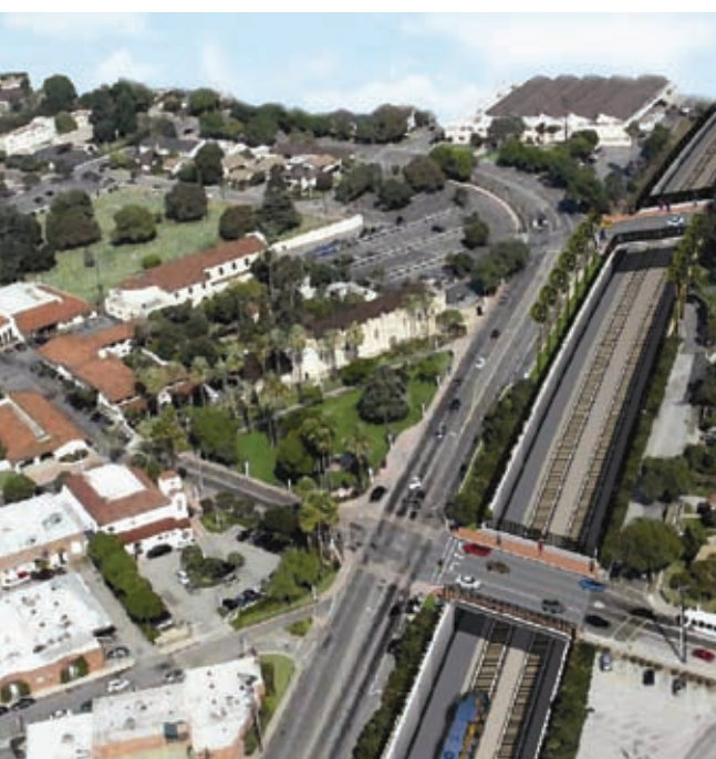
ACE will construct a railroad trench in San Gabriel, allowing cars and pedestrians to cross on bridges.