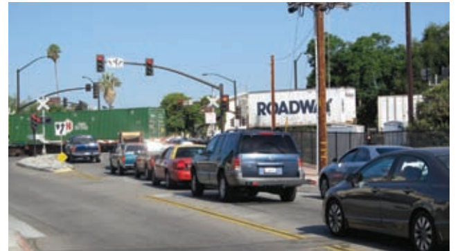
Traffic backs up at the Mission Road crossing in San Gabriel.