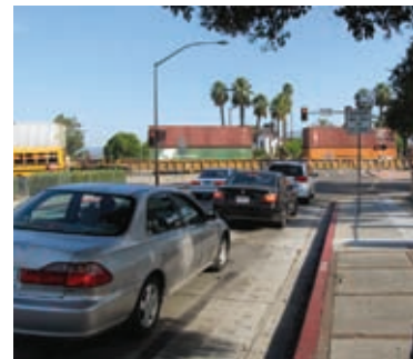
Cars (above and below) idle as a freight train passes in the City of San Gabriel.

"ACE has been recognized as a national model for the cost-effective funding and delivery of goods movement infrastructure projects," Spohn said. "With sufficient additional funding support, ACE can complete the remaining projects in its program of grade separations for the benefit of our region and our nation."